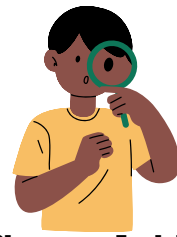
Observe & Explain